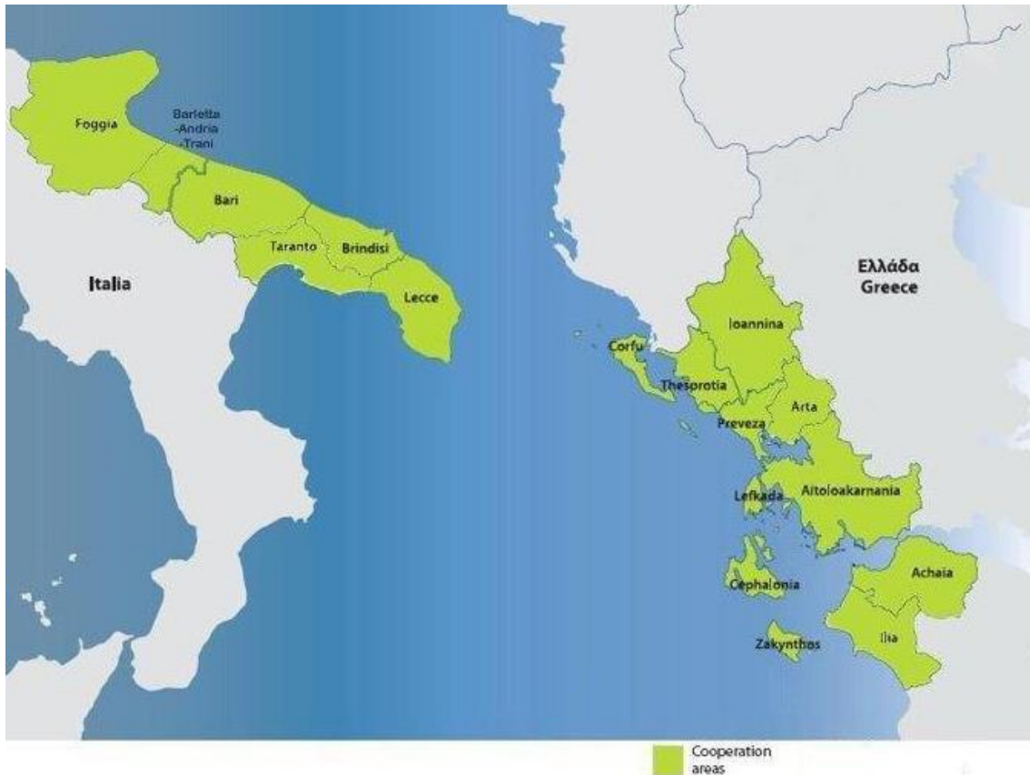
Table 1: Eligible GR-IT Co-operation Programme Area